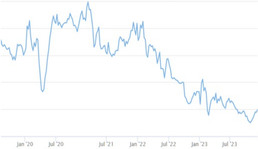
MBA Purchase Index

To get an idea of how much room we have for improvement, we can examine the exact same two metrics in a broader context.