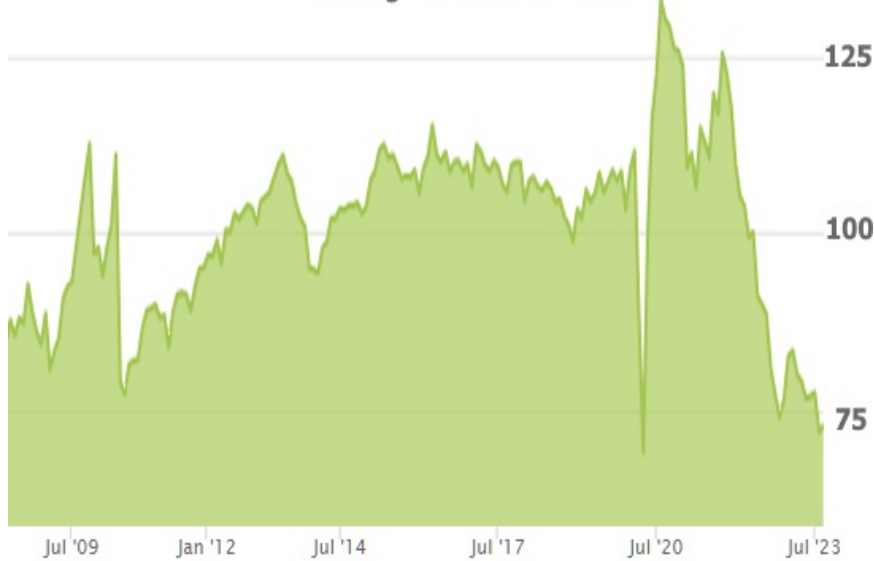
Pending Home Sales Index

Both charts convey post-covid volatility, but one says the housing market is stable and improving while the other says it's as bad as it's been in decades. How can two reports on home sales tell such different stories?